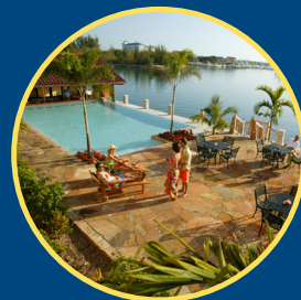
PELICAN BAY GRAND BAHAMA ISLAND