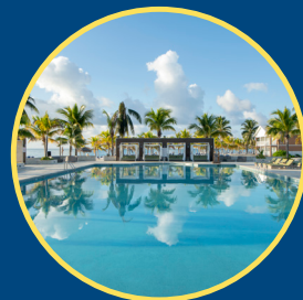
VIVA WYNDHAM FORTUNA BEACH