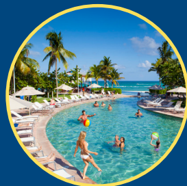
GRAND LUCAYAN GRAND BAHAMA ISLAND

Extend your vacation on land and stay at your choice of three gorgeous resorts on Grand Bahama Island.